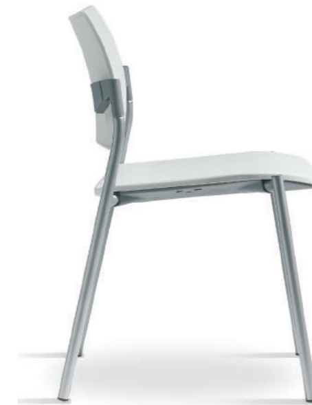
DREAM COMMUNITY CHAIR