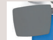
Tavoletta scrittoio. Writing table.